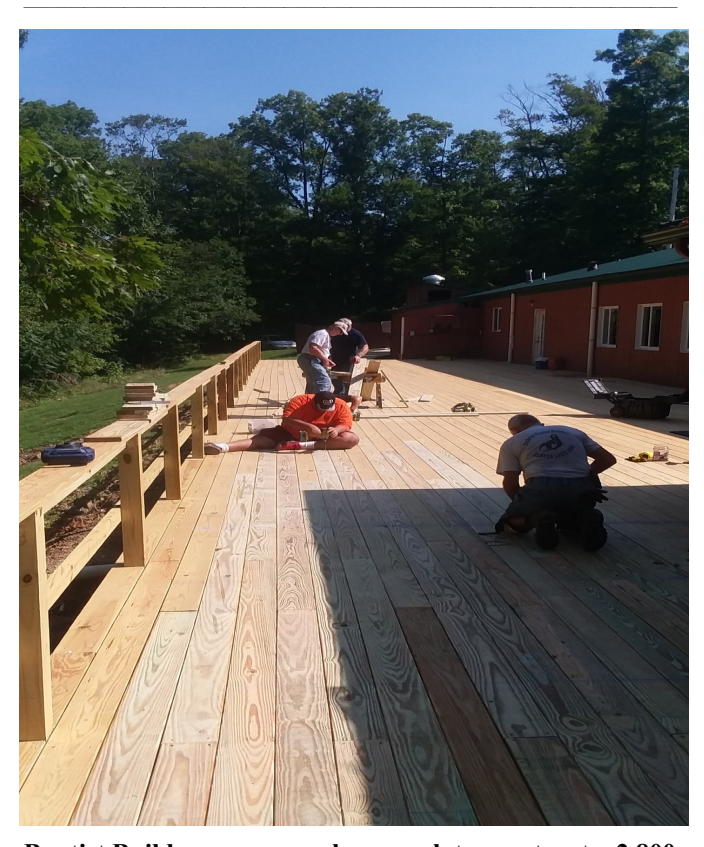
Baptist Builders crew members work to construct a 2,800 square foot deck at Seneca Lake Baptist Assembly at the end of July.