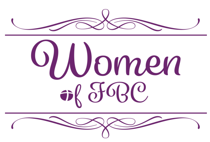
Through the power of the Holy Spirit who lives within us, carefully guard the precious truth that has been entrusted to you. 2 Timothy 1:14

Do you realize God has made an investment in you?